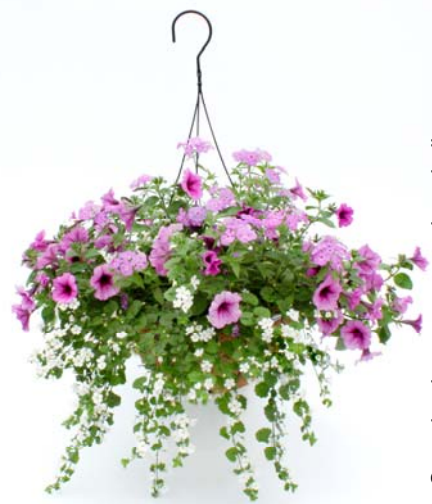
Sample picture—somewhat similar to the plants for sale

100% of Altar Guild funds stay at the Cathedral. We know many of you purchase baskets each spring, so we hope you purchase from us and benefit the Cathedral at the same time!